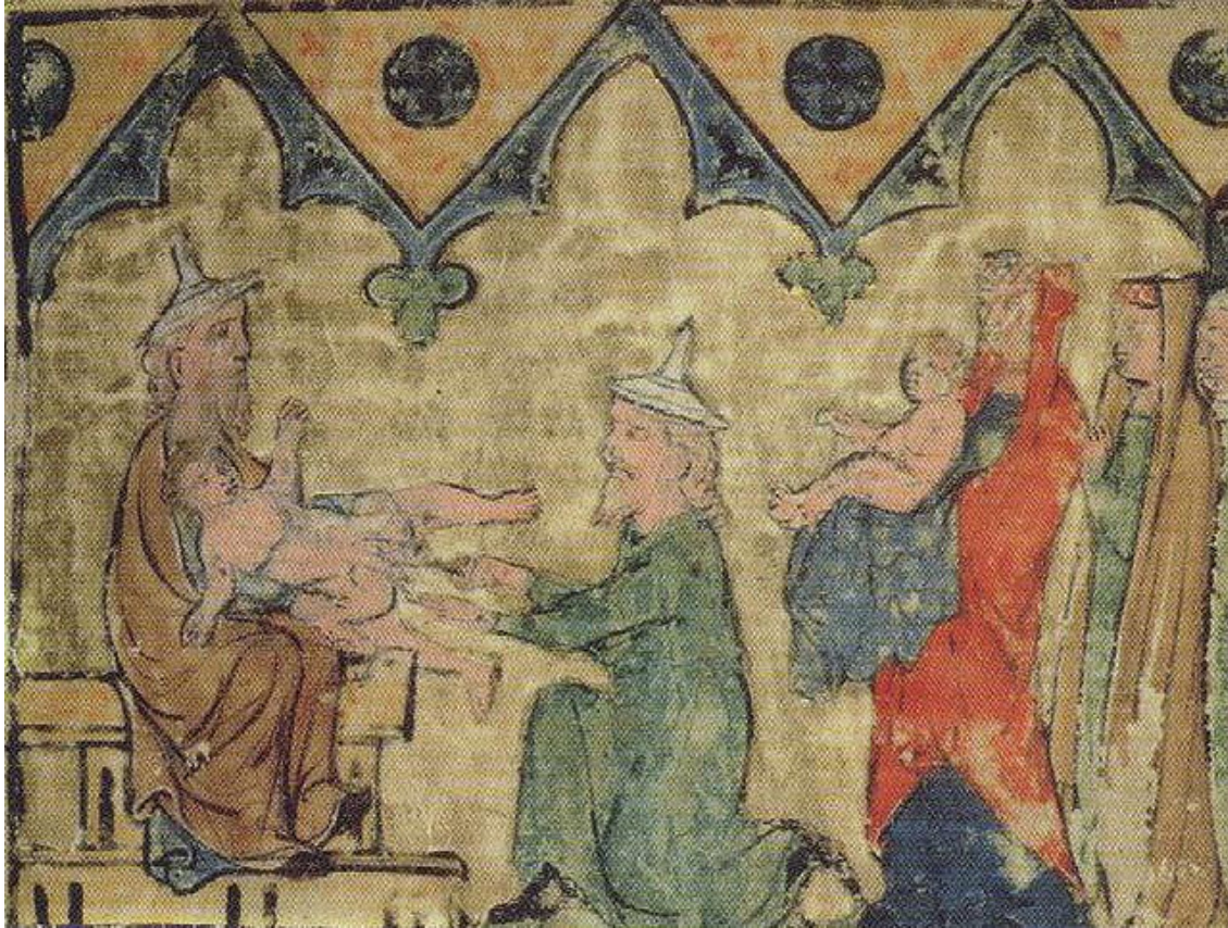
"Isaac's Circumcision," as depicted in the Regensburg Pentateuch, Germany, c. 1300.

Circumcision is seen as the central mitzvah (or commandment) of Judaism. Even for nonreligious Jews, circumcision continues to be perceived as the sine qua non of Jewish identity. And yet, unlike any other controversial topic that we Jews address, the subject of circumcision is not to be challenged. We can calmly discuss whether there is a G-d or no G-d, if G-d is masculine, feminine, or neuter, or whether homosexuals should become rabbis. Yet, questioning circumcision has been out of bounds. This taboo, in and of itself, is indicative of how strong the feelings are that surround this ancient rite, and how much lies below the surface, in the dark silence, where powerful forces have coalesced for thousands of years.