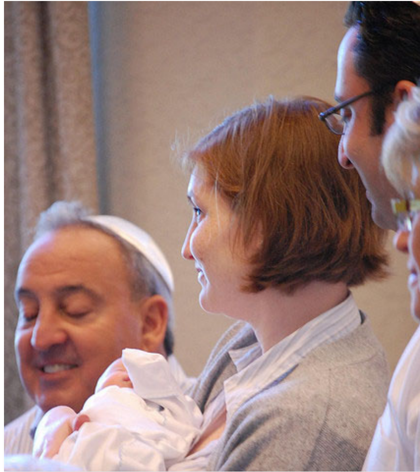
Many Jewish families continue to view their observation of the Torah's circumcision command as a joyous occasion.

Many of us Jews are capable of witnessing a bris , that is, a ritual circumcision, looking into the eyes of the shocked, terrified, and shrieking baby, his head flailing and chin quivering, as his foreskin is severed from the delicate surface of the glans, cut, and crushed, and many of us conclude that this is no different from a routine infant protest of having a wet diaper changed.